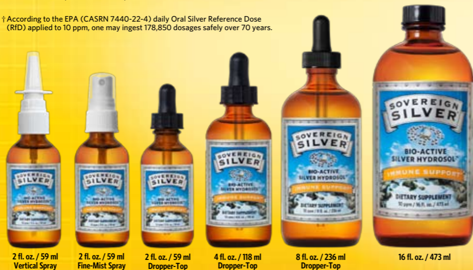
2 fl. oz. / 59 ml Vertical Spray

† According to the EPA (CASRN 7440-22-4) daily Oral Silver Reference Dose (RfD) applied to 10 ppm, one may ingest 178,850 dosages safely over 70 years.