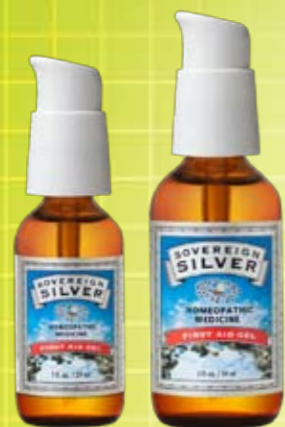
1 fl. oz. / 29 ml Silver First Aid Gel 2 fl. oz. / 59 ml Silver First Aid Gel

Keep one bottle in your bathroom cabinet, one in your car, and one in your purse or briefcase, so you'll always be prepared for life's little accidents.